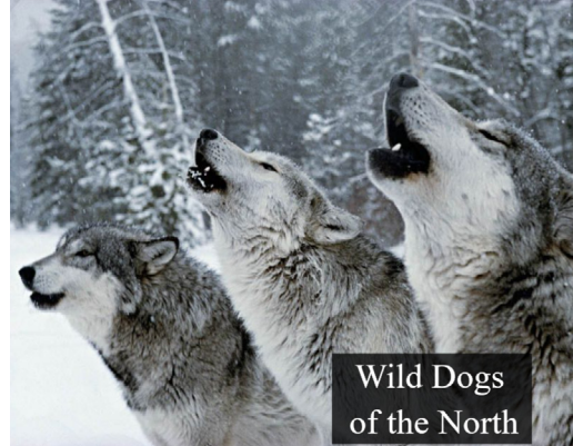
Wild Dogs of the North