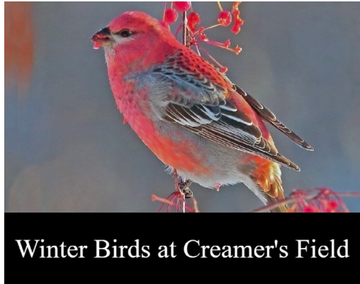
Winter Birds at Creamer's Field

Click on the images below to view our virtual events.