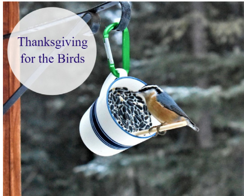
Thanksgiving for the Birds