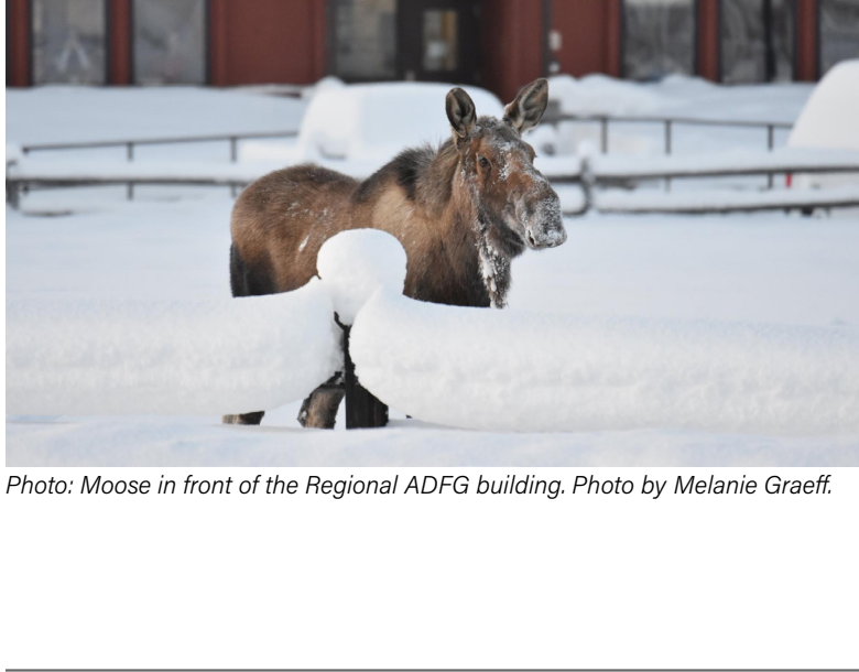
Photo: Moose in front of the Regional ADFG building.