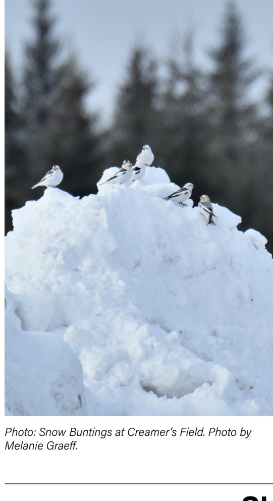
Photo: Snow Buntings at Creamer's Field.