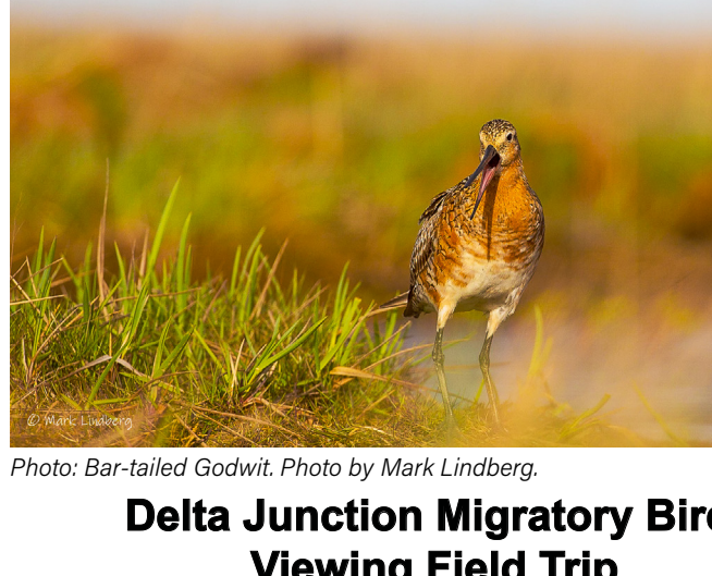
Photo: Bar-tailed Godwit.