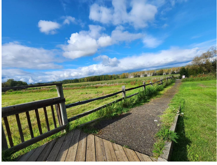
Photo: Creamer's Field trail.