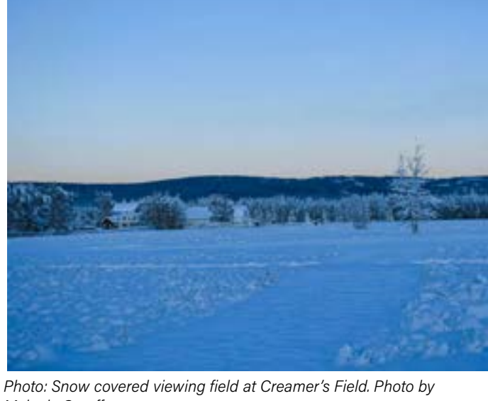
Photo: Snow covered viewing field at Creamer's Field.