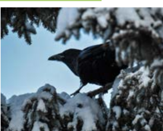
Photo: Common Raven.

The Christmas Bird Count is the longest-running community science bird project in US history. 2023 is the 124th national count and the 63rd count for the Fairbanks region. Creamer's Field makes up a portion of the survey for the Fairbanks count area. Here on the refuge, the survey utilized 10 volunteers that counted 17 different bird species at Creamer's Field Migratory Waterfowl Refuge that included infrequent Snow Buntings, a Bald Eagle, and Willow Ptarmigan! In total, the volunteers covered nearly 88 miles of trails and roads by foot, car, and snow machine.