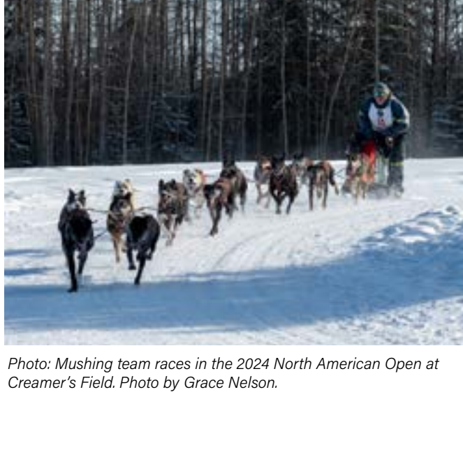
Photo: Mushing team races in the 2024 North American Open at Creamer's Field.