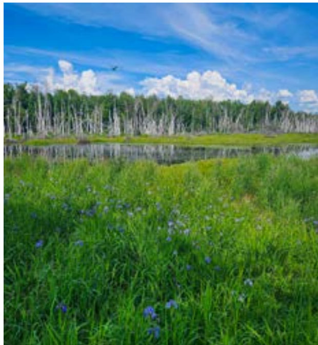
Photo: The Seasonal wetlands.